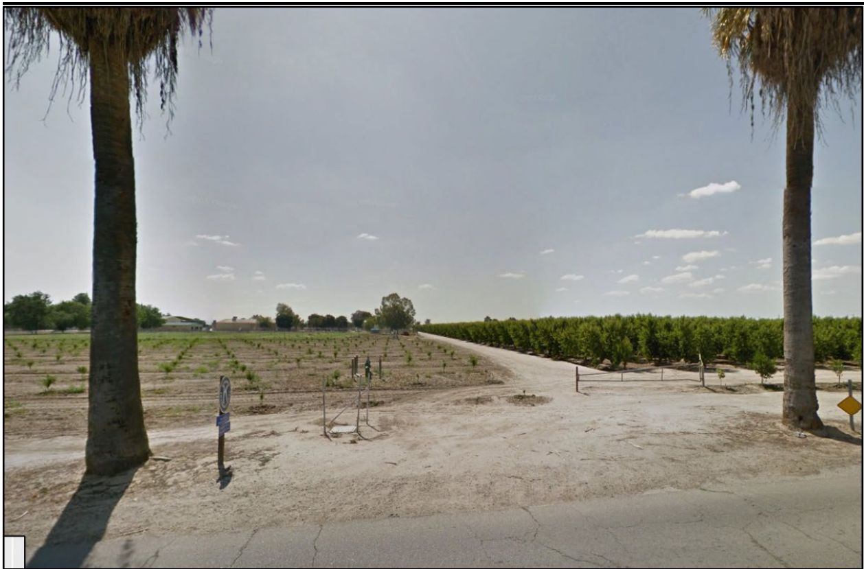
Figure 8. Photo depicting the proposed east Animal Science/College Farm Laboratory entrance at the intersection of Reed and Parlier Avenues.