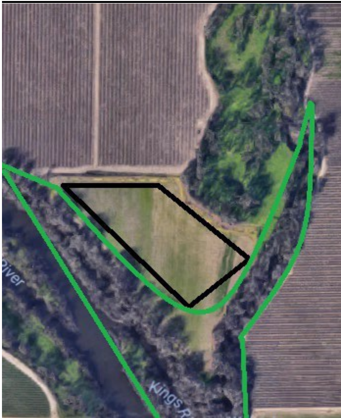
Figure 2. Aerial Photo of PG&E Work Location and Perimeters of Work Boundaries. Green area depicts where riparian restoration and tree replants will take place, black is overlay of perimeter of fence line for the pasture.