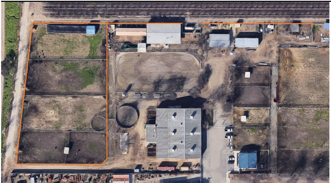
Figure 3. Aerial Photo depicting location of new perimeter fence line for the upper pasture.