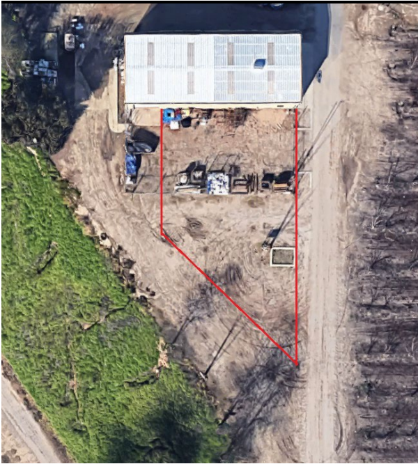
Figure 5. Aerial Photo of proposed new fence line for storage of non-wheeled farm implement equipment.