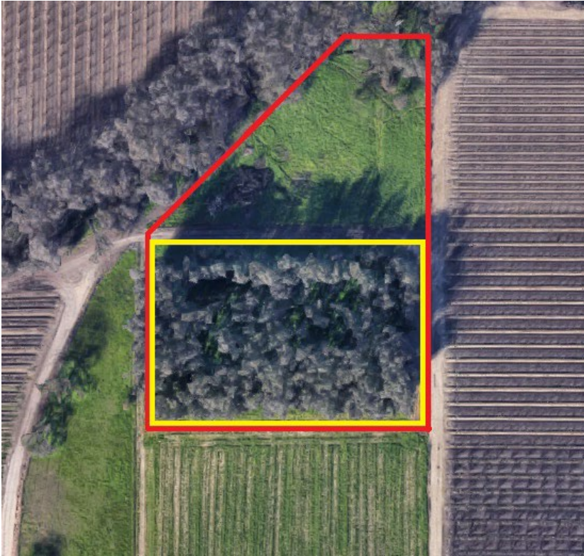
Figure 4. Aerial Photo of where

eucalyptus grove to be removed is located.