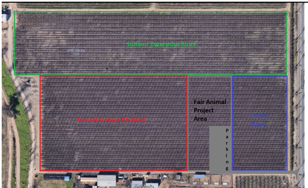
Figure 7. Aerial photo depicting the Animal Science Unit Northern Expansion Area as well as Student Enterprise Block.