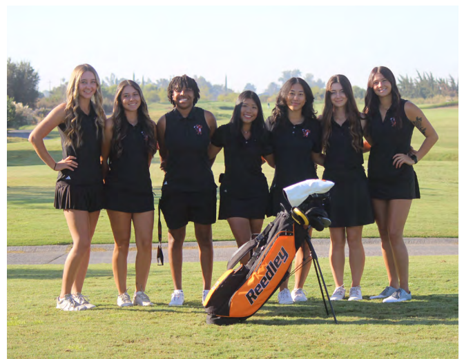
Our Women's Golf Team has finished in 1st or 2nd place in every tournament this season.